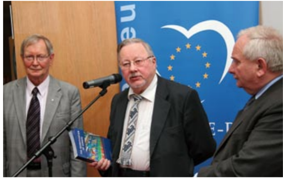
I-r: Tunne KELAM MEP, leader of the Estonian Delegation in the EPP-ED Group; Vytautas LANDSBERGIS MEP, leader of the Lithuanian Delegation in the EPP- ED Group and Joseph DAUL MEP, Chairman of the EPP-ED Group in the European Parliament 2008