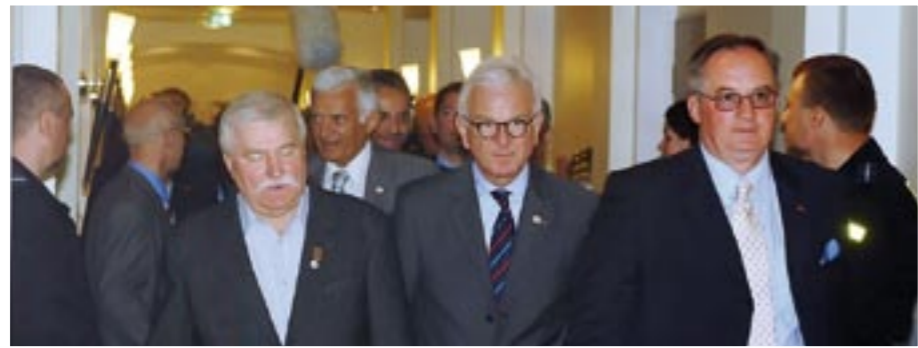
I-r: Lech WALESA, former President and Poland and Leader of Solidarnosc, Jerzy BUZEK MEP, former Prime Minister of Poland Hans-Gert POETTERING, Chairman of the EPP-ED Group in the EP, Jacek SARYUSZ-WOLSKI MEP (EPP-ED, Poland), leader of the Polish Delegation in the EPP-ED Group in the EP and Vice-President of the EP