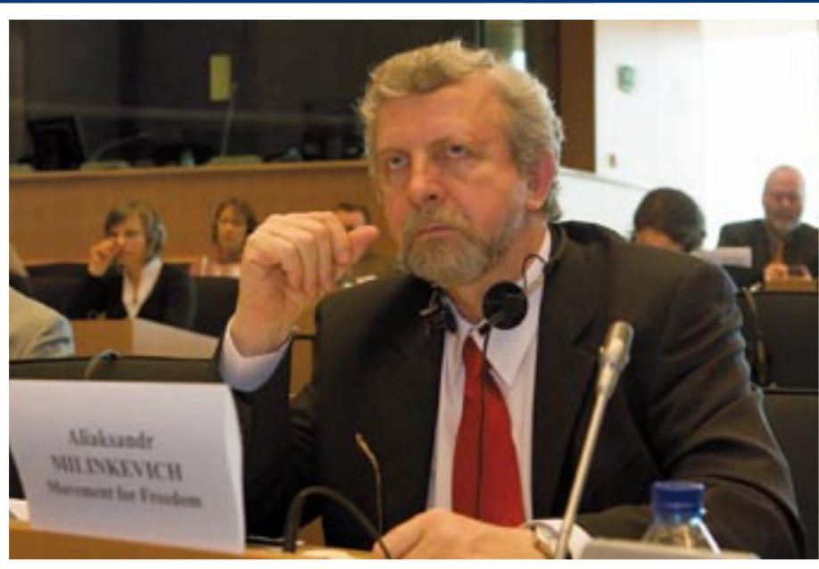
Aliaksander MILINKIEVICH , leader of the Movement for Freedom of Belarus