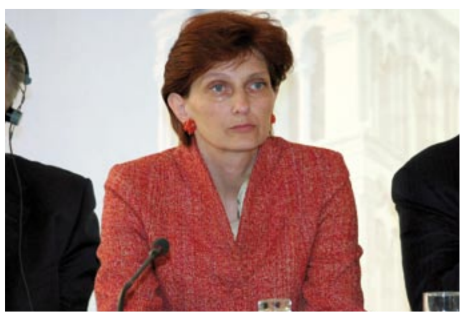
Ana LOVRIN, Croatian Minister of Justice