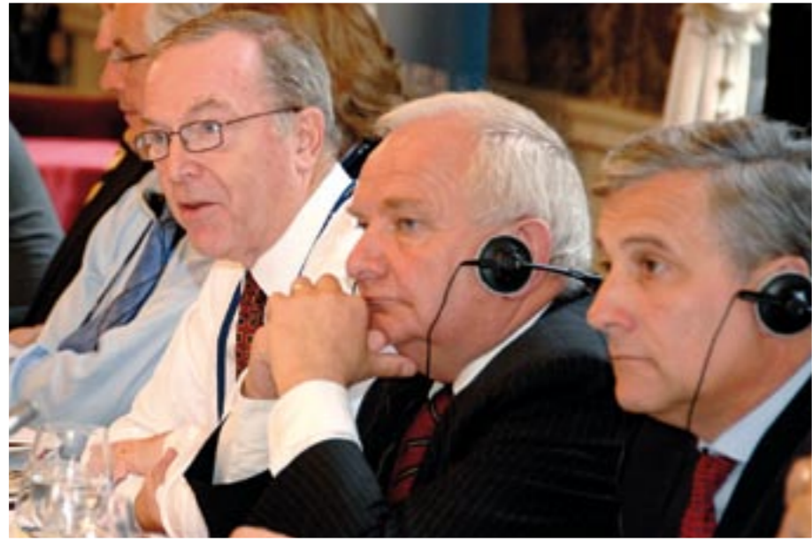
l-r: Wilfried MARTENS , President of the EPP, Joseph DAUL MEP, Chairman of the Committee on Agriculture and Rural Development in the European Parliament, and Antonio TAJANI MEP, Vice-Chairman of the EPP Party and Head of the Italian Delegation of the EPP-ED Group in the European Parliament