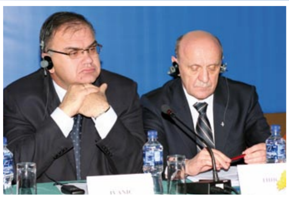
l-r: Mladen IVANIC , Leader of the Party of Democratic Progress, Bosnia & Herzegovina, and Sulejman TIHIC , Leader of the Party of Democratic Action, Bosnia & Herzegovina

To conclude, Sulejman Tihic paid special thanks to Doris Pack MEP, Chairwoman of the Delegation for relations with South-East Europe, for her continuous support and engagement in BIH and in the region.