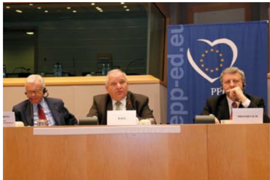
l-r: Hans-Gert POETTERING, President of the EP, Joseph DAUL, Chairman of the EPP-ED Group in the EP, Aliaksander MILINKIEVICH, leader of the Movement for Freedom of Belarus