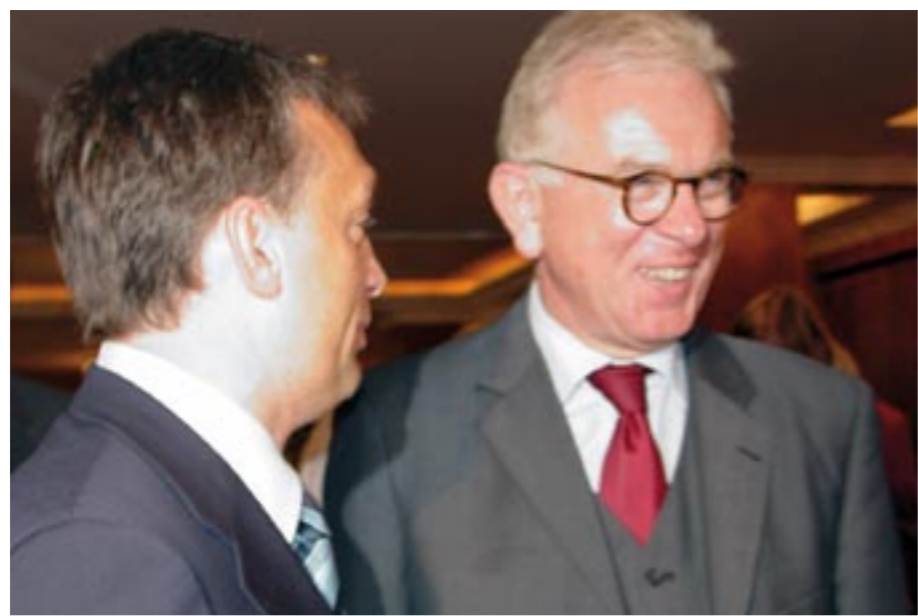
Viktor ORBAN , Former Prime minister of Hungary and leader of FIDESZ Party and Hans-Gert POETTERING MEP, Chairman of the EPP-ED Group in the EP 2006