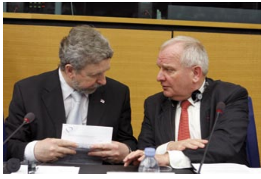
A. Milinkievich's visit to EP, Brussels, 8 October 2008

r-l: Joseph DAUL, Chairman of the EPP-ED Group in the EP, Aliaksander MILINKIEVICH, leader of the Movement for Freedom of Belarus