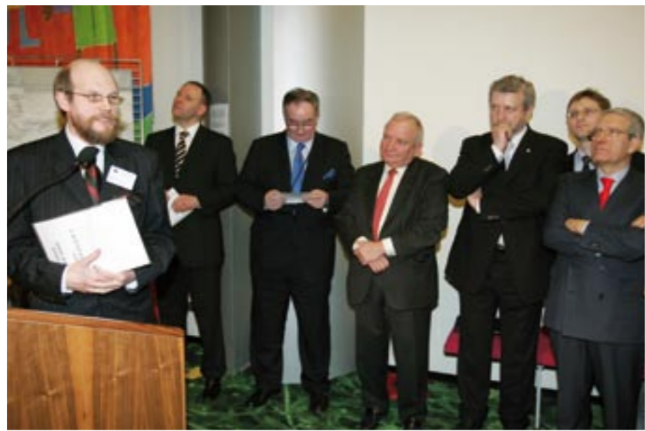
Belarus Week, Strasbourg 10-13 March 2008