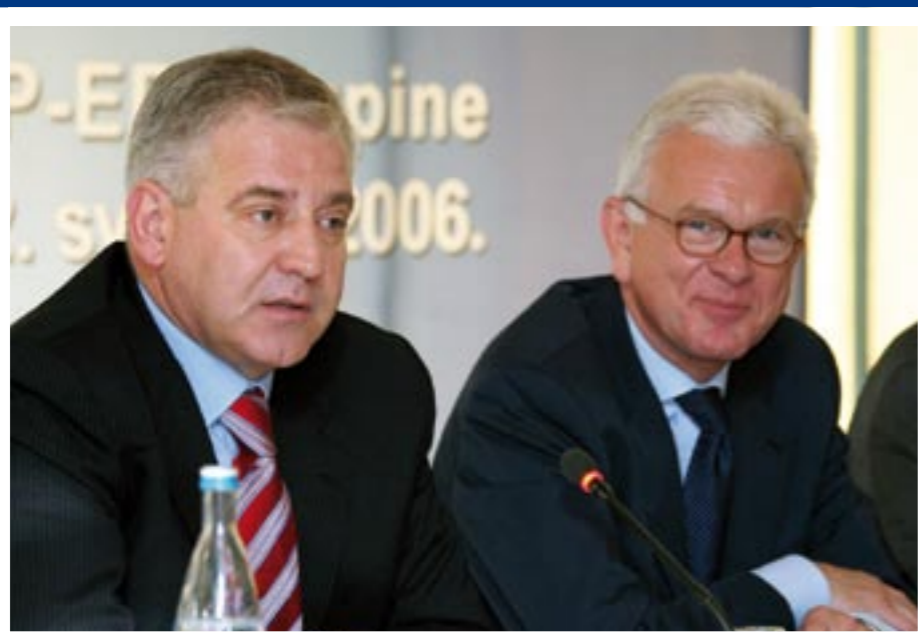
r-l: Hans-Gert POETTERING MEP, Chairman of the EPP-ED Group in the European Parliament and Ivo SANADER, Prime Minister of Croatia