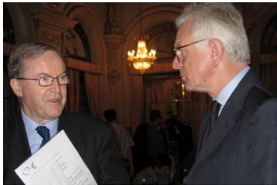
I-r: Wilfred MARTENS , Chairman of the European People's Party and Hans-Gert POETTERING MEP, Chairman of the EPP-ED Group in the European Parliament

The presence of Romanian Observers in the European Parliament was also a discussion point on the agenda of the EPP-ED Group Bureau meeting. The EPP-ED Group was fully aware of the importance of Romanian Observers in the European Parliament and was making concerted efforts to find a practical way to welcome Romanian Observers as soon as conditions allowed.