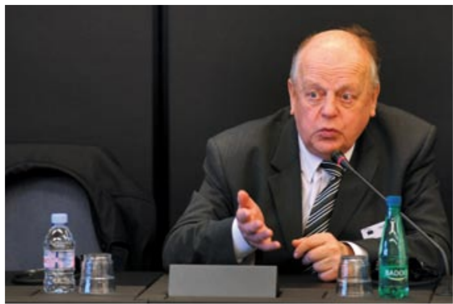
Stanislau SUSKIEVIC , first leader of the Independent Republic of Belarus