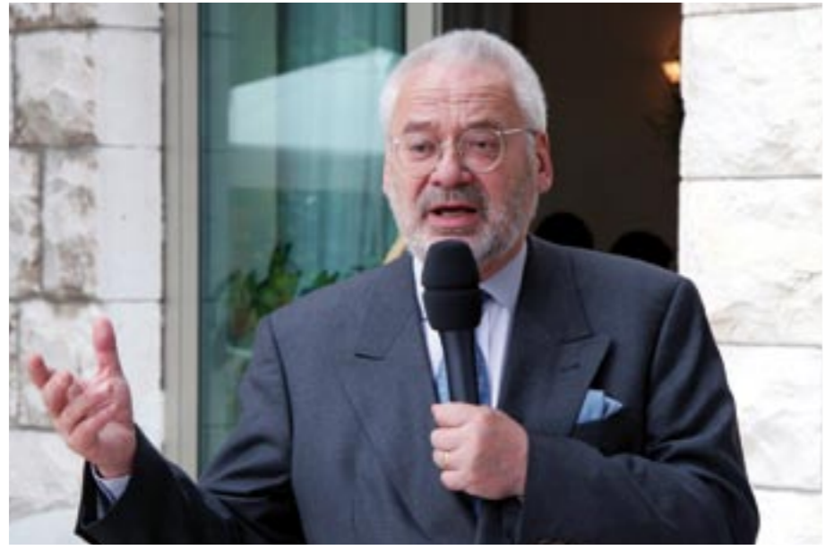
Erhard BUSEK , Special Coordinator of the Stability Pact for South Eastern Europe