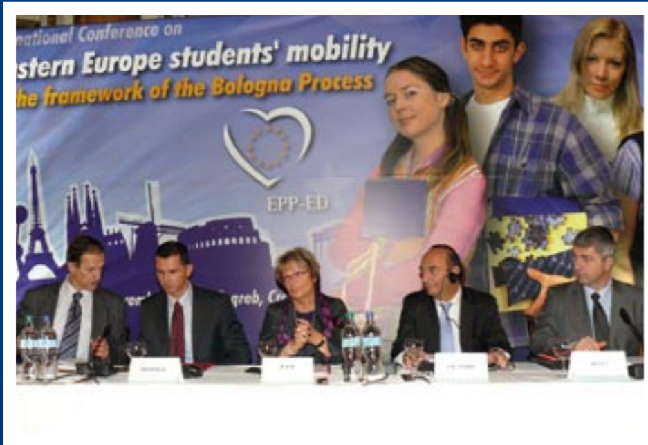
EPP-ED Group International Conference on South Eastern Europe students' mobility in the framework of the Bologna Process, Zagreb (Croatia), 21 November 2008