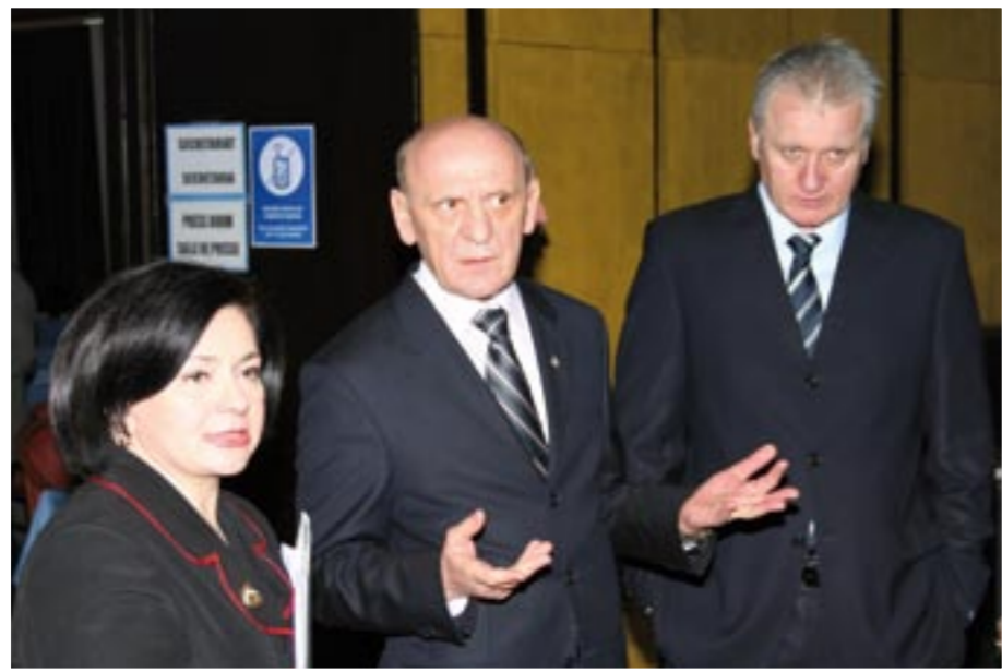
l-r: Senada KOLENOVIC, SDA Party, Sulejman TIHIĆ, Leader of the Party of Democratic Action, Bosnia & Herzegovina, and Desnica RADIVOJEVIC, Minister of Trade of the Federation

The head of the EU Police Mission (EUPM), Brigadier-General Vincenzo Coppola , added that the EUPM's remit was to support the local police, fight organised crime and ensure the accountability of local police forces.