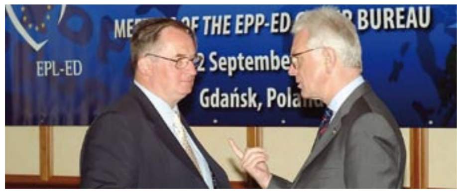
I-r: Jacek SARYUSZ-WOLSKI MEP (EPP-ED, Poland), leader of the Polish Delegation in the EPP-ED Group in the EP and Vice-President of the EP and Hans-Gert POETTERING, Chairman of the EPP-ED Group in the EP